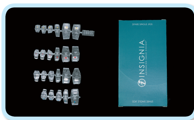
■ Fig. 2b: Single jigs for bracket rebonding