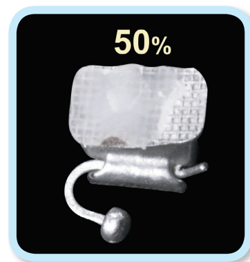
■ Fig. 1c: 50% residual resin left on the bracket base

Solution: Apply bite turbos to increase the vertical dimension of occlusion (VDO).