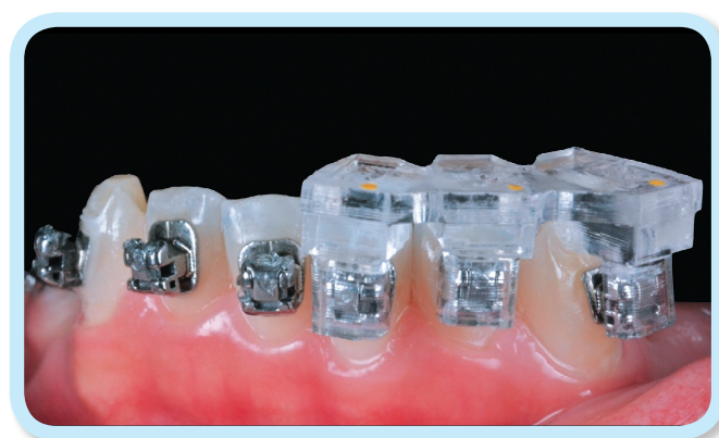
■ Fig. 2a: Group jigs for initial brackets positioning

Insignia® provides group jigs to initially position the brackets (Fig. 2a). In addition to the group jigs, a single jig is prepared for each tooth (Fig. 2b). The single jig's inner-face is designed with a more detailed map than the group jig, which provides more stability and retention when fitting it on the tooth (Fig. 2c).