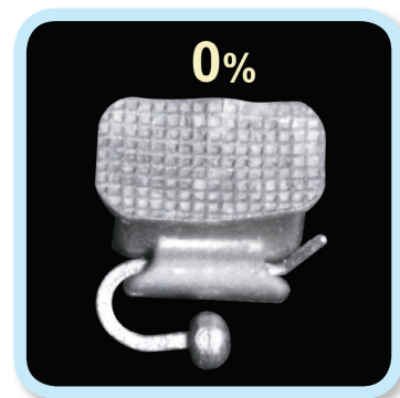
■ Fig. 1b: 0% residual resin left on the bracket base

Solution: Clean and dry the bracket base completely. Replace the bracket if the base is too smooth by checking with a sharp instrument.