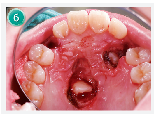
■ Fig. 9: By using high power suction and an electric knife, these tools facilitate blood coagulation.