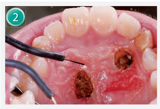
■ Fig. 5: Use a dental electric knife to remove the soft tissue covering the impaction's crown.