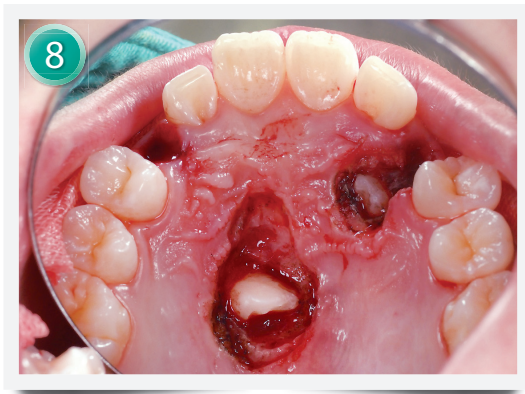
■ Fig. 11: Control bleeding with an electric knife.

COE-PAK can help stop bleeding and cover the wound for patient's comfort. It will delay soft tissue healing and avoid the soft tissue covering the impaction again. The epithelium averagely grows at the rate of 1 mm per day, much faster than autoeruption of the impaction. Remove COE-PAK three days after the surgery and monitor the emergence of the impaction after 3 weeks (Fig. 14).