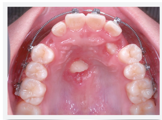
■ Fig. 14: COE-PAK was removed 3 days later. Impacted cuspids start to erupt 3 weeks after the surgery.