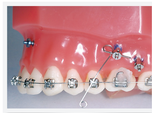
■ Fig. 16: 2x12 mm OBS with 3D lever arm