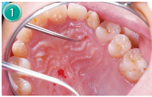
■ Fig. 4: After applying local anesthesia, use an explorer to mark the crown.