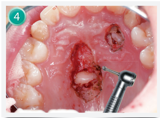
■ Fig. 7: Remove the covering bone with a high speed handpiece and a carbide round bur.

Eighth , control bleeding with an electric knife and irrigation with normal saline (Fig. 11).