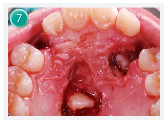
■ Fig. 10: The main purpose is to remove more bone down to CEJ to make impacted cuspid easily to erupt.