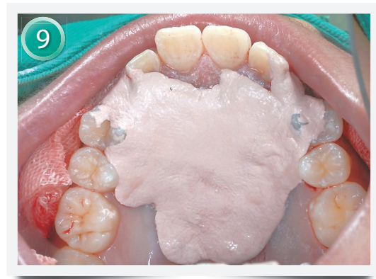
■ Fig. 12: Spread vaseline on the gloves as a coating to make them stick proof.