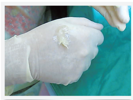
■ Fig. 13: Cover the wound with COE-PAK and pack it into the interdental space so it will be caught between the undercut.