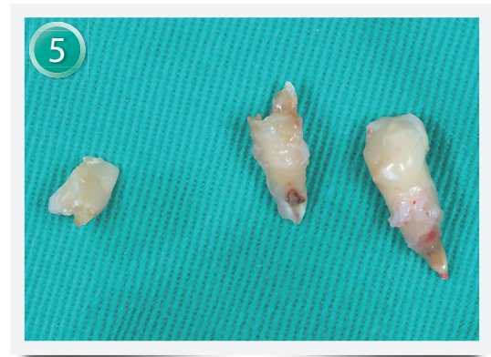
■ Fig. 8: Extract 53, 63 primary teeth.