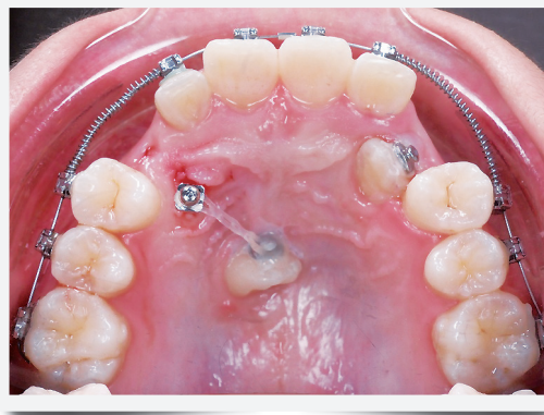
■ Fig. 15: Two months later, use a palatal miniscrew with power chains to retract right canine.