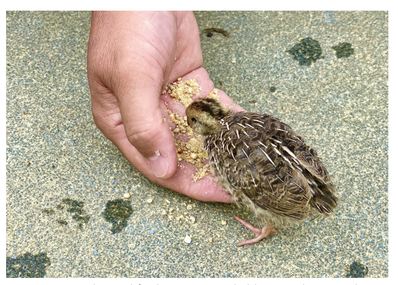
Fig. 10: A juvenile quail feeding on grains held in Dr. Chang's palm is a sure sign that the quail have become accustomed to their surroundings.