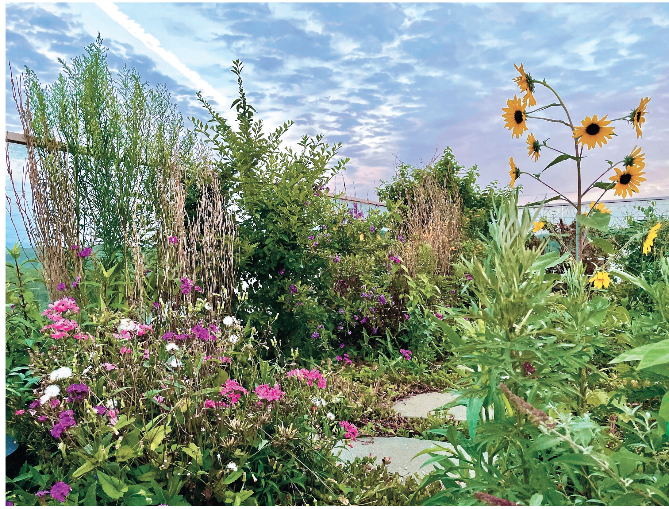
Fig. 5: The messier, the merrier. The plantation is not set out to fit a specific graphic design as most gardens are. Nature has its own idea of beauty, and the creation is just an eye-brightening ordinary miracle.