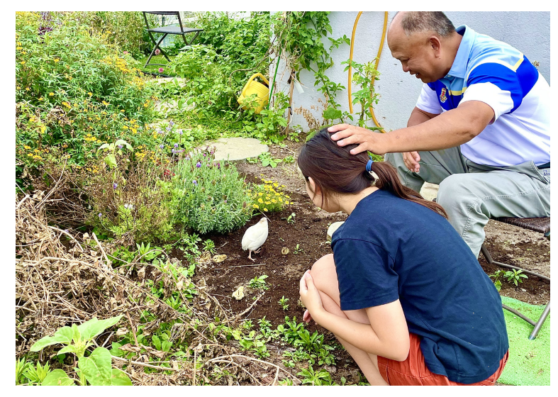
Fig. 12: Father-daughter bonding time while overlooking a mother Texas A&M quail bonding with her chicks creates an extraordinarily heart-warming scene in the garden.