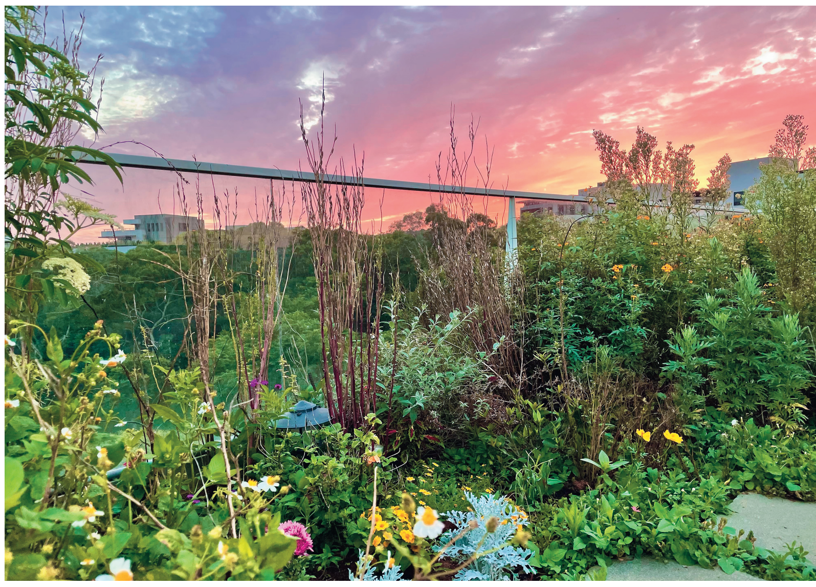
Fig. 9: A dreamy ombré dusk sky adds a further touch of enchantment to the endearing rooftop garden.