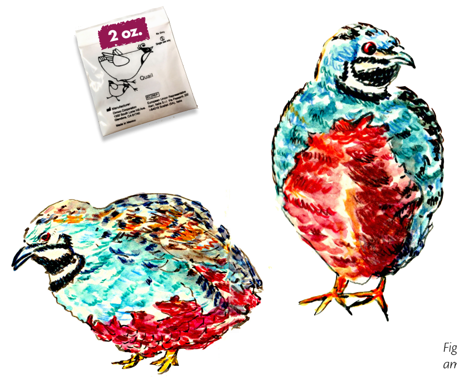
Fig. 8: Chinese painted quail plumage: amazing illustrations by the talented young artist, Jenny Chang. From their iconic blackand-white pattern on the chin, Dr. Chang speculates that the doodles on the package of the Ormco quail elastics (20z, 3/16") are also inspired by this breed.