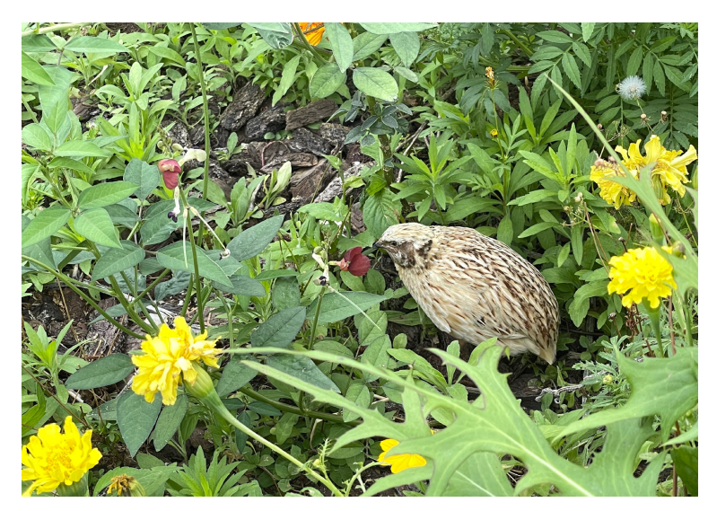
Fig. 11: A fully-fledged, golden-colored Italian quail peeking through some lush vegetation