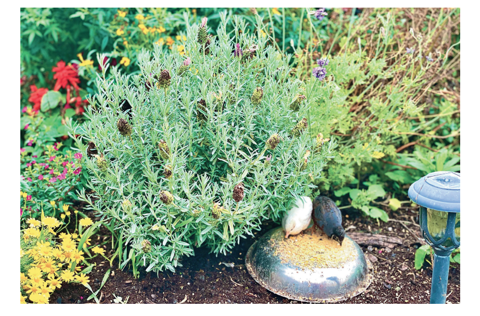
Fig. 1: Tin basins are set upside-down to serve as a feeding tray, preventing the feed from getting damp from the soil and allowing easy cleaning.

To accommodate quail in a suitably realistic living environment, Dr. Chang had his mind set on creating a garden on his rooftop. By doing so, predation that occurs mostly on ground floor level - not only by pests such as snakes and rats, but also by common household pets such as cats and dogs - can be avoided. A core condition for a rooftop garden that is both sustainable and, more importantly safe, lies in the drainage system.