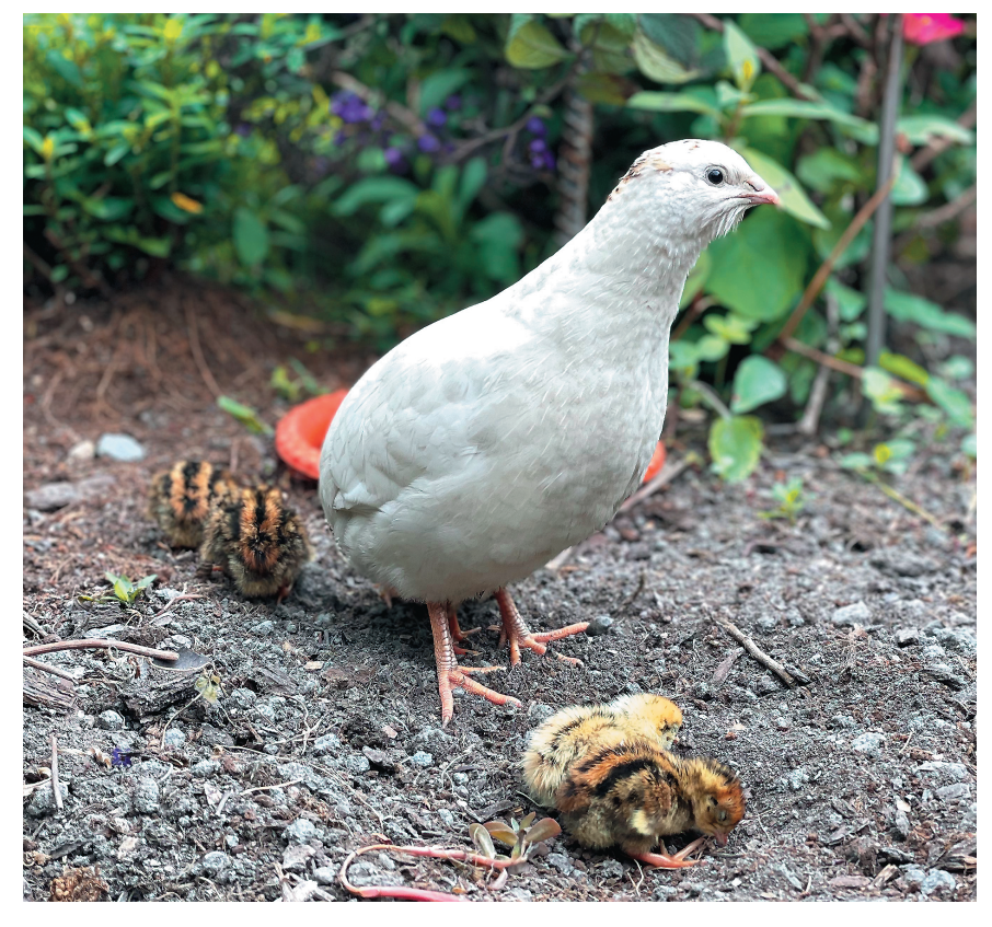
Fig. 3: A mother Texas A&M quail keeping herself alert while her chicks doze off during their stroll in the garden (Watch this quail family in action: https://youtu.be/e_1PvdfUiC0)