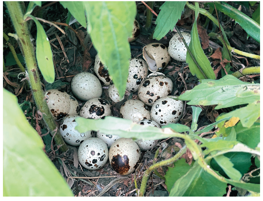
Fig. 4: Quail make their nests in bushes or among tall grasses. Around 10-16 eggs would be laid in one clutch, with brown and black speckles on them as disguise.