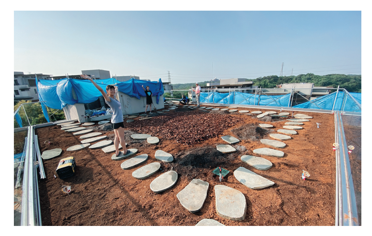
Fig. 6: The weight of the different materials making up planting medium has to be taken into consideration during distribution: heavy materials around the edges, and light ones in the center. Stone panels are arranged onto the soil as a walkway after planting is completed.

As Dr. Chang would say in an advocating manner, "No over-retention of water means no leaking!" (不積水,就不漏水!) As long as the garden does not retain excess water, the chances of leakage can be minimized. This also reduces considerably the amount of weight that the building has to bear, ensuring structural stability and residential safety.